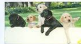
Dressing the New Guide Dogs for the Blind Puppy Truck