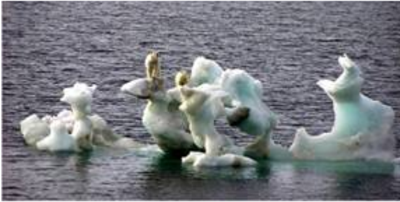
Gary Braasch http://www.braaschphotography.com/