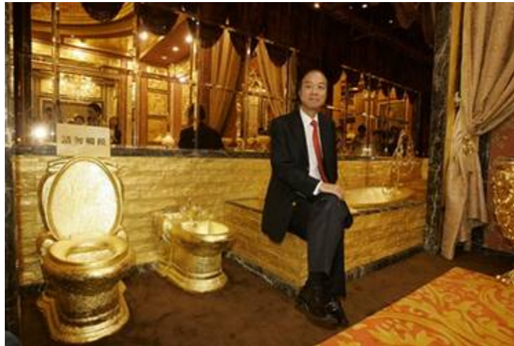
Lauren Greenfield www.laurengreenfield.com/

Learn more about fighting rampant consumerism: