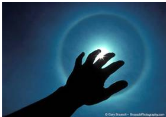
How we live on the planet affects all life. We must learn to choose lifestyles and practices that are in harmony with Nature. http://www.braaschphotography.com/

Conservation Photographers: http://www.ilcp.com/